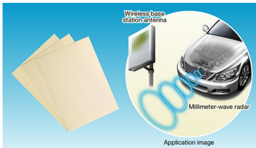
Halogen-free Ultra-low Transmission Loss Multi-layer Circuit Board Material R-5410 (February 2021, Panasonic)

Osaka, Japan – Panasonic Corporation announced today that its Industrial Solutions Company has commercialized R-5410, Halogen-free Ultra-low Transmission Loss[1] Multi-layer Circuit Board Material suitable for millimeter-wave[2] antennas. Mass production will begin in March 2021.